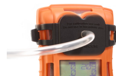
Bump/calibration plate To apply test gas to T4