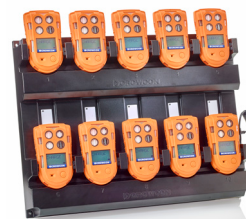
10 way charger For charging and storing your T4 fleet *Not available for UL certified products