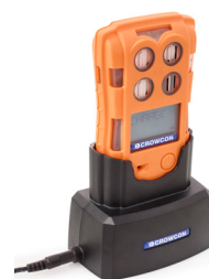
Cradle charger Docking station for easy charging