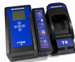
I-Test Easy automated bump testing and calibration solution