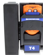
Vehicle charger Effective charging and storage whilst travelling