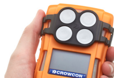
External filter plate Clip-on filter for dusty environments