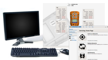
NEW Portables Pro 2.0 Software For easy configuration and servicing