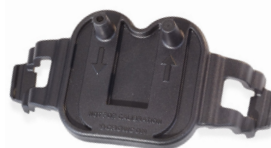
Aspirator plate Sample atmosphere prior to entry